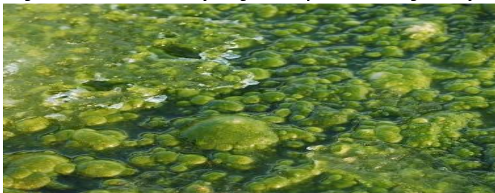
Figure 1: Algae present in the Nashik Ecological System

Despite the presence of algal diversity in Nashik, there is a need for comprehensive studies to document and assess the composition, distribution, and ecological roles of algal communities in the region. Such research efforts could contribute to better understanding the functioning of aquatic ecosystems, monitoring water quality, and implementing conservation measures to safeguard Nashik's natural resources. Moreover, raising awareness about the importance of algal diversity and promoting sustainable management practices can help mitigate threats such as pollution, habitat degradation, and invasive species, thereby preserving Nashik's botanical heritage for future generations. Algae are a diverse group of photosynthetic organisms that can be found in various aquatic and terrestrial habitats. They play crucial roles in ecosystems, serving as primary producers and contributing to oxygen production, nutrient cycling, and food webs. Algal diversity encompasses a wide range of taxa, including both unicellular and multicellular organisms, with different morphologies, life cycles, and ecological adaptations.